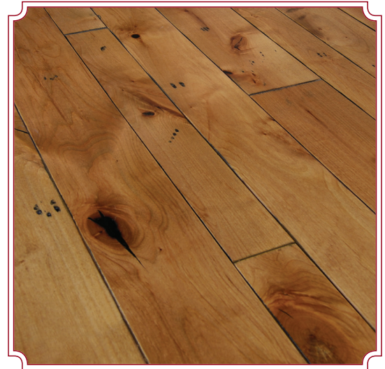
Country in random width option

Red alder, the beautiful West Coast hardwood is used exclusively in the Antique Alder Collection . These hardy, fast-growing trees are considered to be a renewable resource and assist in regenerating soil for future forest growth. All of our lumber is carefully processed from responsibly managed groves, allowing homeowners to enjoy their choice of flooring even more. A unique antiquing process of hand distressing, pillowing and staining lends a true historic patina to these pre-finished solid planks.